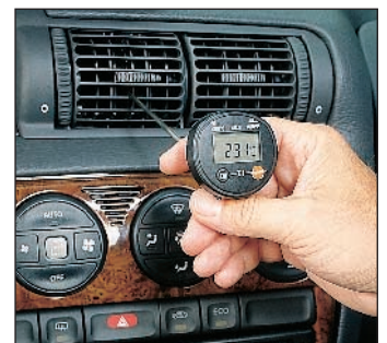
Measurements on air conditioning systems