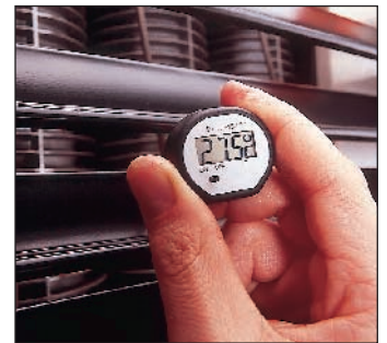
Measurements in the HVAC industry