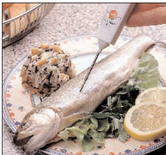
Checks the correct cooking temperature of sensitive food e.g. fish

The testo 106 penetration thermometer is ideal for quick, uncomplicated core temperature checks in all areas e.g. catering, hotels, industrial kitchens, supermarkets etc.